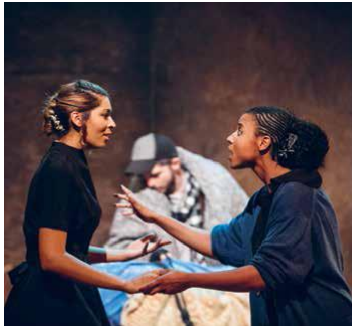
As You Like It By William Shakespeare, public production

The BA (Hons) Programme is a 3-year full-time degree. The course year comprises a total of 30 weeks made up of separate units. The course year is normally arranged as 3 X 10 week terms however this can vary as required. The degree offers 120 credits at Levels 4, 5 & 6 of the credit framework. It is the purpose of course design that units provide you with opportunities for ongoing development. The course leads to opportunities for individual study specialism in the later terms. Units vary in form and structure and include practical sessions, lectures, seminars, workshops, large and small-scale production activity, and small group projects.